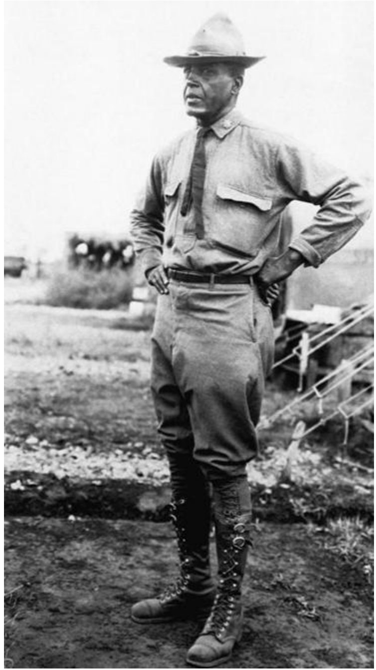
Charles Young of the 10th Cavalry in 1016.

Weaving scholarly analysis with interviews of leading black environmentalists and ordinary Americans, Finney traces the environmental legacy of slavery and Jim Crow segregation, which mapped the wilderness as a terrain of extreme terror and struggle for generations of blacks—as well as a place of refuge.